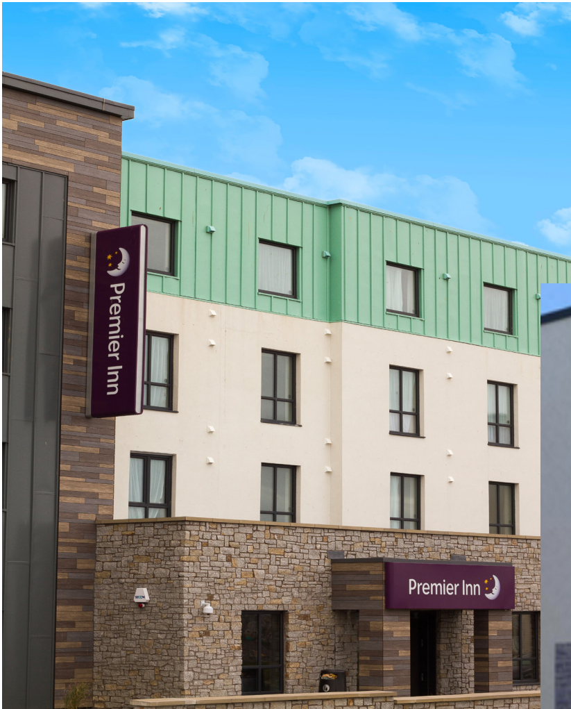
Finished project (left)