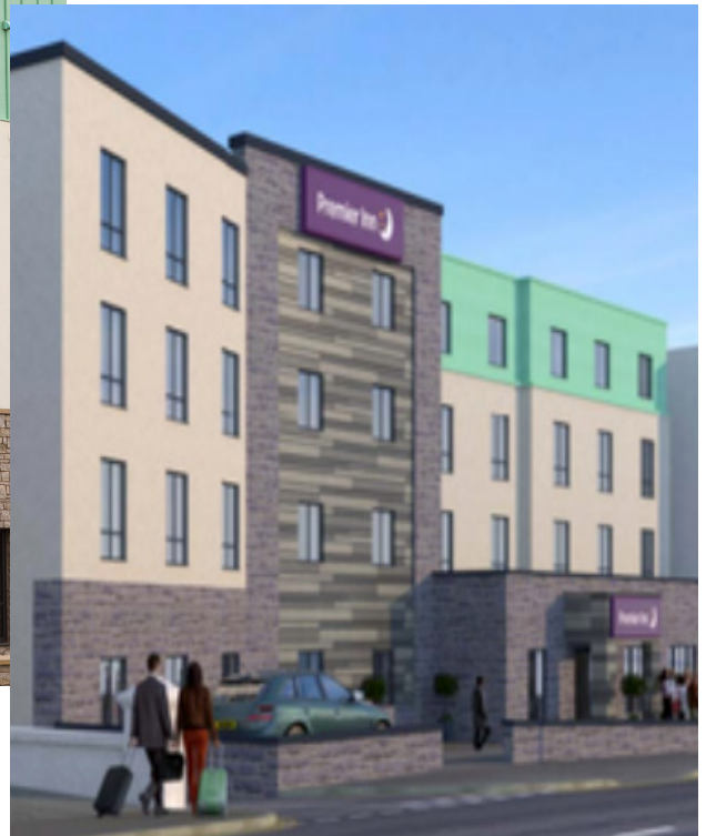
Artist representation (below)

This project was specified by the EWI Pro Technical Team, the contractor and the final client. In summary, specification involved the following components: